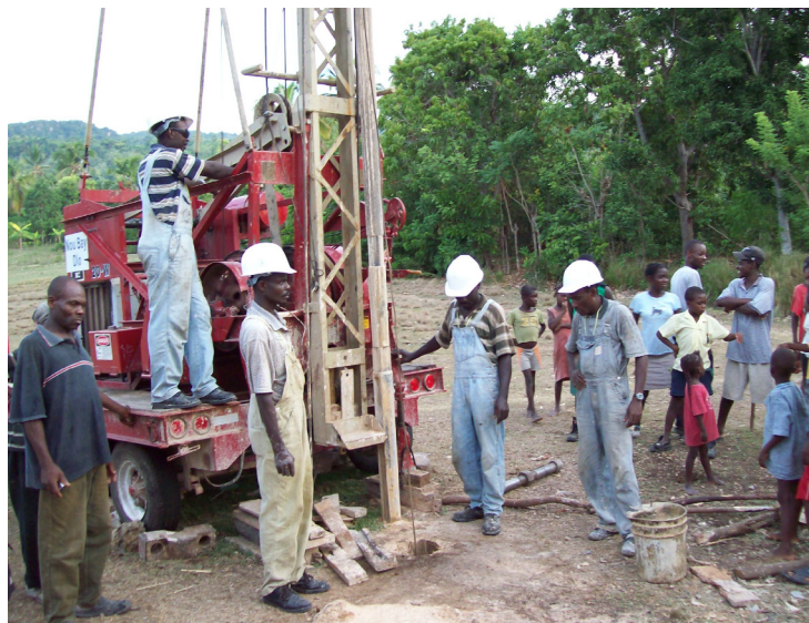
Drill Team hard at work.